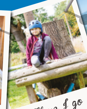
Here I go