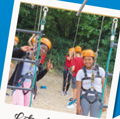
Let's do this